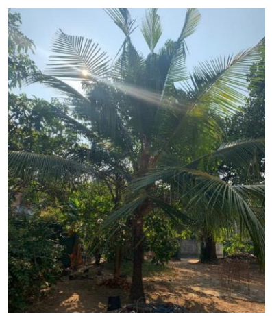
Fig-1: Coconut leaves