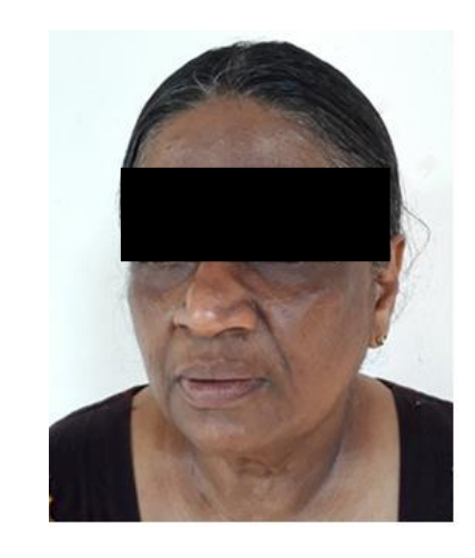
Fig-4: After Treatment