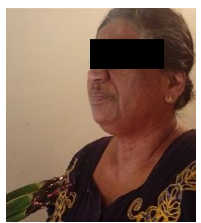
Fgg-2: Fumigation in progress