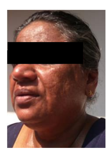
Fig-3: Before Treatment