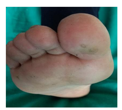
After 1 week