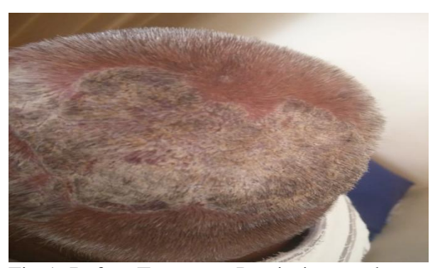
Fig-1: Before Treatment Psoriasis at scalp