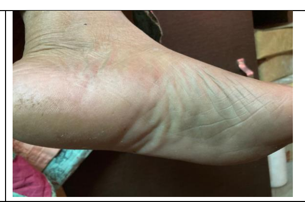
Fig-3: After treatment left foot