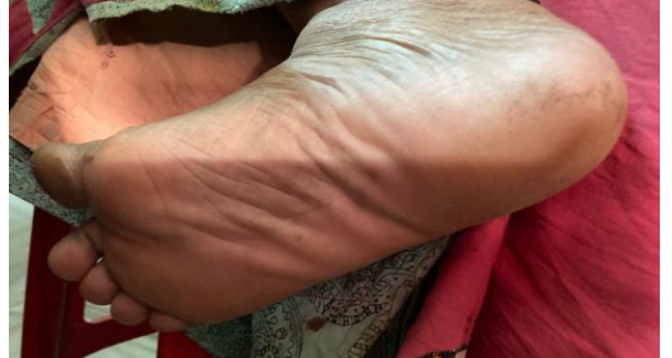
Fig-4: Before treatment Right foot