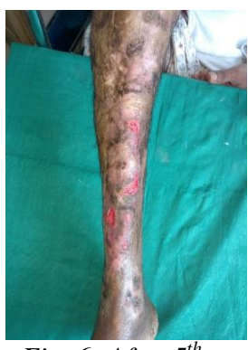
Fig. 6: After 5<sup>th</sup> Week