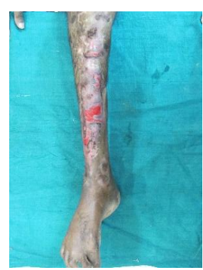
Fig. 5: After 4<sup>th</sup> Week