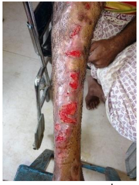
Fig. 4: After 3<sup>rd</sup> Week