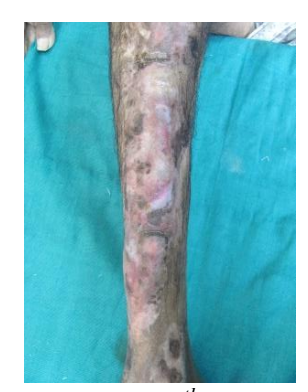
Fig. 7: After 6<sup>th</sup> Week