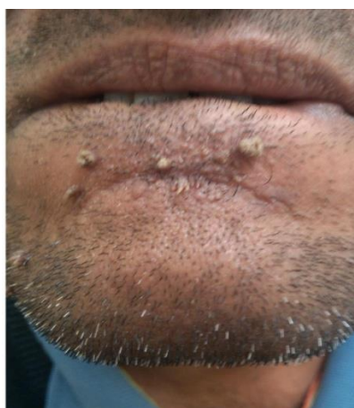
Figure 2- Multiple warts on chin taken on 03/08/2020