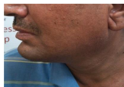
Figure 10: Lesions disappeared. (taken on 04/01/2021)