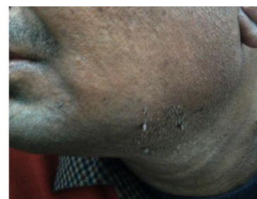
Figure 7: Lesions drying up (taken on 23/11/2020)