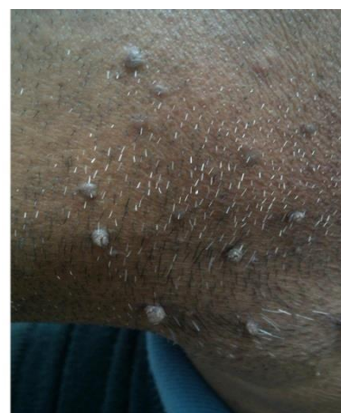
Figure 3- Multiple warts on left side of face, taken on 03/08/2020