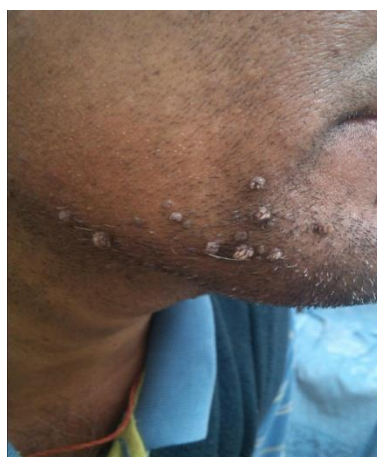
Figure 1- Multiple warts on lower right side of face, taken on 03/08/2020

Provisional diagnosis – Filiform warts on the basis physical examination. [3]