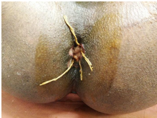
Fig-3: Post-Operative 5 th day