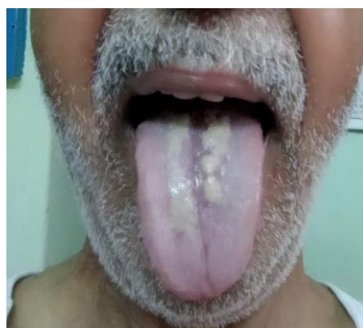
Fig 2: 2 nd visit (17.04.2023)