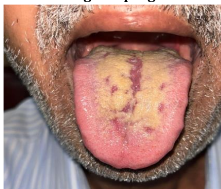
Fig 1: 1 st visit (03.04.2023)