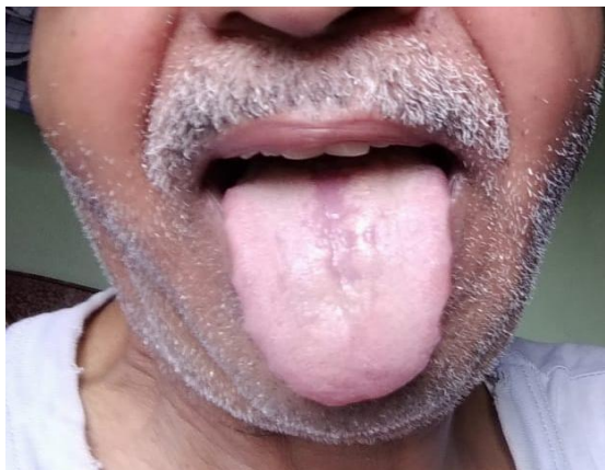
Fig 4: 4th visit (19.06. 2023)