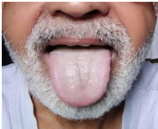
Fig 5: 5th visit (10.07.2023)