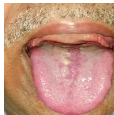
Fig 3: 3 rd visit (22.05.2023)