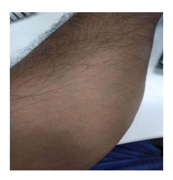
AFTER VIRECHANA AFTER 45 DAYS OF VIRECHANA