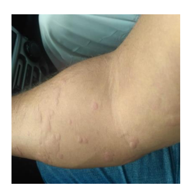
AFTER 30 DAYS OF VIRECHANA